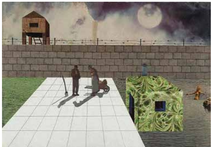
Exodus, or the Voluntary Prisoners of Architecture, The Allotments, Collage, 1972 (MoMA Collection ©2013 Rem Koolhaas).

The walled garden is almost certainly the earliest form of garden. The walls serve to protect the plants from a harsh environment, rather than being a defence against human intruders. Yet when I think of walls, fences and hedges, I think of 'enclosure' and the polemics of land use: private property, boundaries, defence, occupation, secrecy and war. 'Enclosure' is surely one of the most controversial land policies. The conversion of common land into private property defines the move into the industrial age. Still, a wall can provide shelter and warmth, it can frame a view, emphasise a transition, and make a dwelling possible.