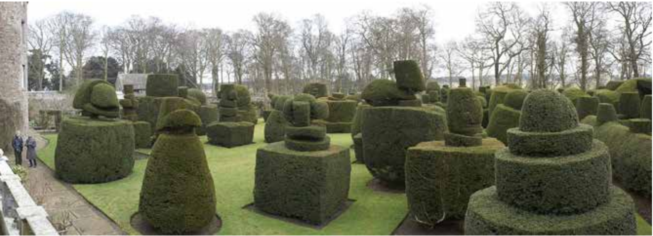
Topiary by Robert Lorimer at Earls Hall Castle, Scotland 2012.

existing transitions in the landscape such as ditches, edges of fields and streets. The fence would not be continuous, the boundary would not be closed. For specific locations on the borders of the village several sketches were drawn up: of abstract objects, flat or three-dimensional, some inhabited by plants, some not. Their form was inspired by the garden designs of Robert Lorimer, a nineteenth-century Scottish architect who was drawn to the Arts and Crafts Movement and applied its distinctive style and approach in his work. Thomson used elements of Lorimer's visual grammar to reinforce the tension between sculpture and nature. From Thomson's proposal: 'The aesthetic language I will use comes from the language that Robert Lorimer used in the topiary at Earls Hall, Scotland in 1893. These unique trees could be considered a very early, perhaps visionary example of abstraction – more indicative of abstract sculpture from the first half of the twentieth century than classical topiary. In this abstract reflection on such a concrete subject, the tree, I find a pertinent example of how we could reflect upon the type of "nature" we are constructing. I have been studying the design of these trees and have started to build my own aesthetic grammar from it.'