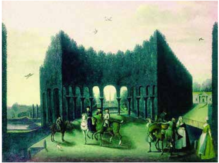
The Topiary Exhedra with a View of the Obelisk, Hartwell House, Buckinghamshire by Balthasar Nebot.

garden is only to be looked at, it sets up a relationship based on a theatrical visual staging and puts the viewer-gardener in a passive position. Therefore, recently, the art of gardening seems an increasingly pertinent discipline to me. Especially in today's media-driven society in which perception increasingly becomes fragmented and truncated, there are two aspects of gardening that assume antagonistic qualities. Firstly, its time: it could take decades for trees to become established. Secondly, in its dedication and focus, the repeated action and the constant attention needed, a reciprocal relationship is formed between the garden and the gardener or caretaker.