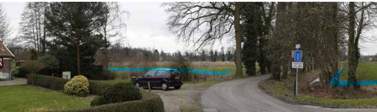
Line of fence.

the opinion that gardens are equally elements of imagination and memory, physical place and cultural construct. As such, gardens are as much connected to prohibition as to transgression, as much a source of fear as of delight. Looking at an aerial view of the first garden I lived with, I see that it is in fact square and walled, rather than the long and narrow shape I remember.