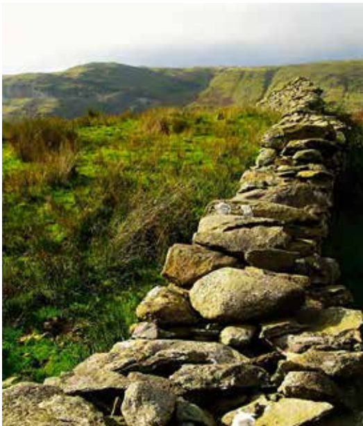
Dry Stone Dyke.